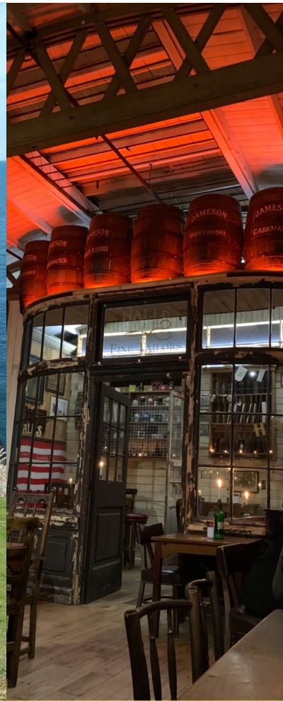
Music & Dance